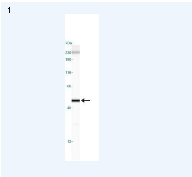
Figure 1: beta-Actin Antibody [NB600-503] - Simple Western lane view shows a specific band for Beta Actin in 0.1 mg/ml of HeLa lysate. This experiment was performed under reducing conditions using the 12-230 kDa separation system.